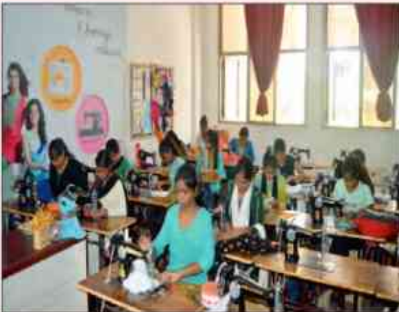
Domestic Tailoring Class