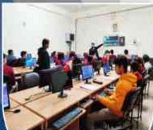
Python Coding Advanced Computer Courses