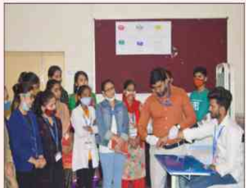
GDA (Patient Care Training)