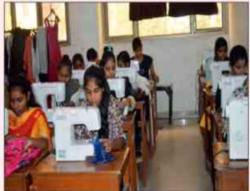
Fashion Design Tailoring Class