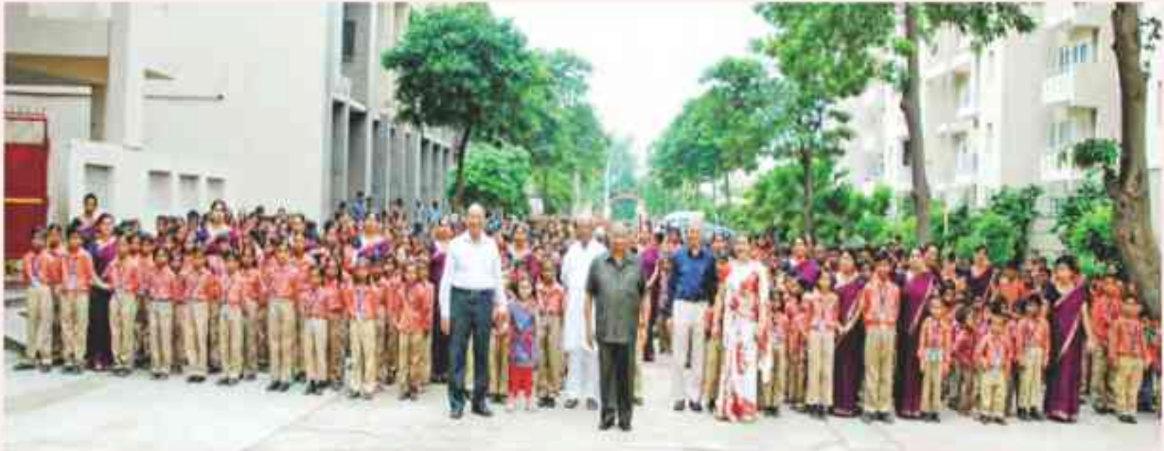
Independence Day Celebrations at Shirdi Sai Baba School, Faridabad

Shirdi Sai Baba Temple Society, registered in 1988, is a non-for-profit free educational Institute and aims to have a positive impact on the society. It works towards implementing holistic social development projects across multiple causes including Education, Women's Empowerment, Skill Development with placement, Health Care, Mass Marriages, and Distribution of Clothes and Livelihood.