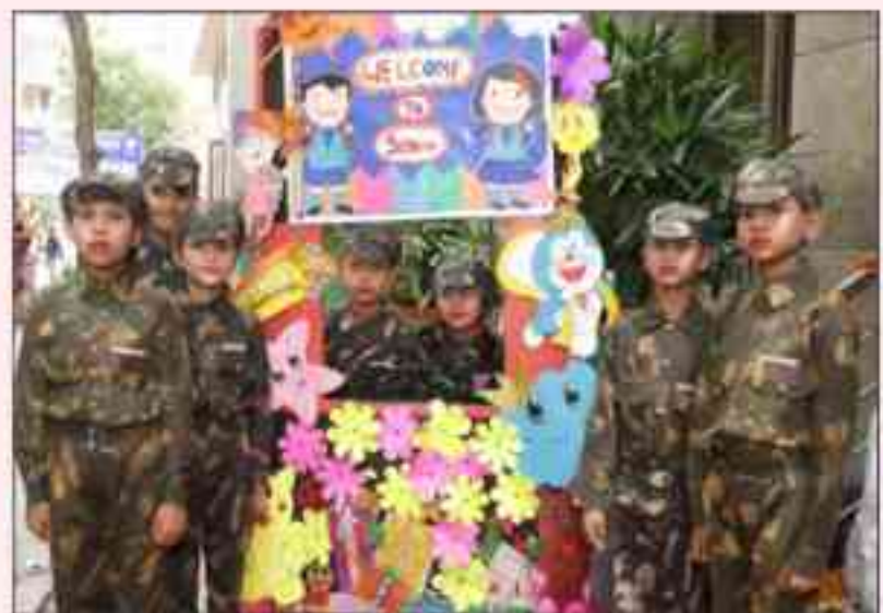
KG Class Activity