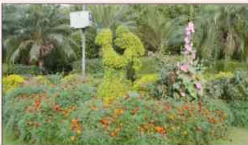
Mother's love displayed in the greenery