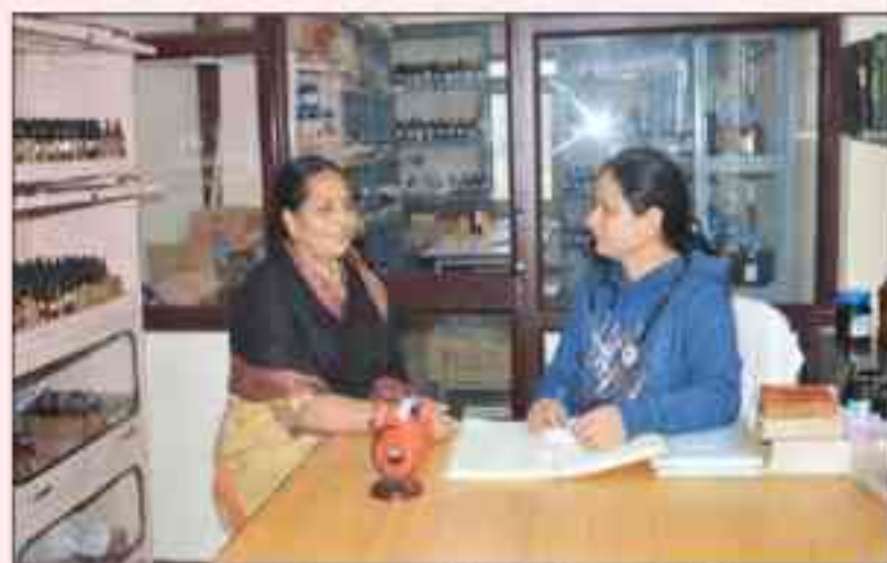
Homeopathic Clinic at Sai Dham