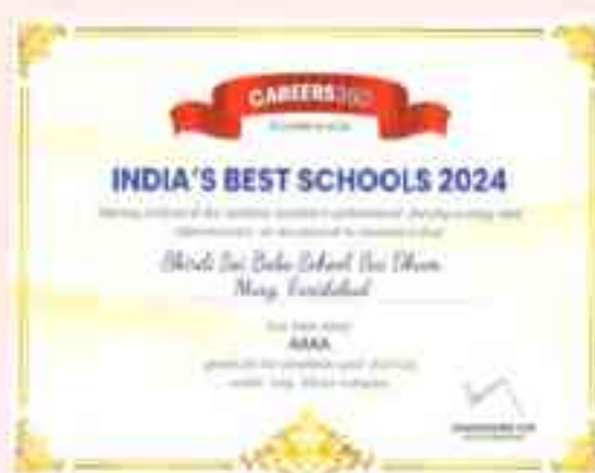
Recognized as India's One of the Best Schools