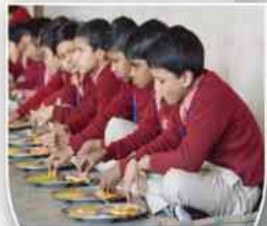
Free Nutritious Food