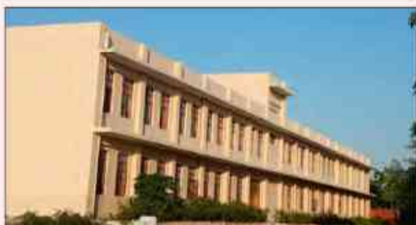
Shirdi Sai Baba School, Niswara, Dist. Mahoba (UP)

Since education is essence of progress, it needs innumerable temples of learning. Our NGO is committed to promote free and quality education in the country to ensure that no child remains illiterate. In pursuance of this mission, we set up replica of Shirdi Sai Baba School in Bundelkhand's backward village Niswara, Block Panwari, District Mohaba (UP).