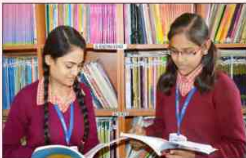
Children in library

A well-furnished library, excellent chemistry, physics, biology and maths labs, meditation and cultural activities with indoor and outdoor sport facilities are also provided to the students.