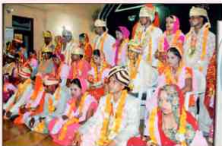
Mass Marriage Event

To mitigate hardship of poor parents, mass marriage of about 100 girls are performed in four batches of 25 each in a year, irrespective of caste, creed and without any expenditure to their parents. So far more than 1200 marriages have been performed. This is being primarily done to solve difficulties, poor people face in arranging funds for marriage of their daughters for which they often are forced to borrow few thousand rupees on interest even at 5% per month that many a times they are unable to repay throughout their lives. Thus by the assured savings they can now spend more money on the education of their daughters.