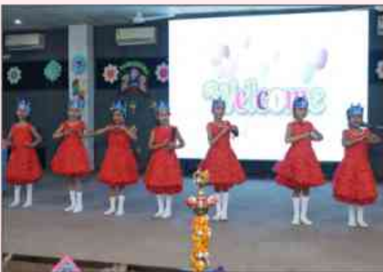
KG class students performing play

Touched by the plight of poor children from neighboring clusters, loitering aimlessly around our campus, it occurred to us that these children needed an opportunity to be educated along with some incentive to motivate them to do so. We, therefore, in April 2004, established 'Shirdi Sai Baba School' at Faridabad (Haryana) for providing 100% free and quality education to underprivileged children with food, uniforms, books, study material, sports, health care and excursion. The motivation to underprivileged people bore fruit and the number of children has since risen to 1500+ at Faridabad 450+ at Niswara Dist Mahoba – Backward Bundelkhand in UP out of which over 50% are girls at both centres. The schools are as good as any public school in India and the school at Faridabad is now affiliated to CBSE upto Senior Secondary level with English medium and school at Niswara is upgraded upto 12th class by Uttar Pradesh Madhyamik Shiksha Parishad.