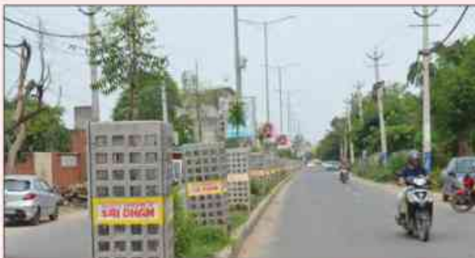
69 Neem trees planted in the verge of Sai Dham Marg

Sai Dham's initiative for mother nature will be advantageous to generations to come as it will give shade, clean & cool air, and place for birds to make nests. The tree is of great importance for its disinfectant properties. It is used for maintaining soil fertility and its extract is added to fertilizers as a nitrification inhibitor. Neem has traditionally been used as a teeth cleaning twig. It is also useful for cure of many diseases.