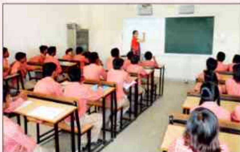
One of the Smart Classes