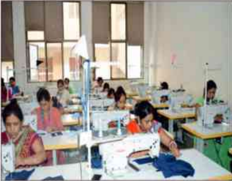
Industrial Tailoring Class, Vocational Training Centre

To provide an opportunity to youth hailing from under-privileged segment of the society, the institution is imparting free training in the trade of 'Industrial Sewing, Domestic Tailoring, Dress Designing, Beauty & wellness, Computer education certified by NIIT, and General Duty Assistant (Patient Health Care) etc. and after training the trainees are provided placements.