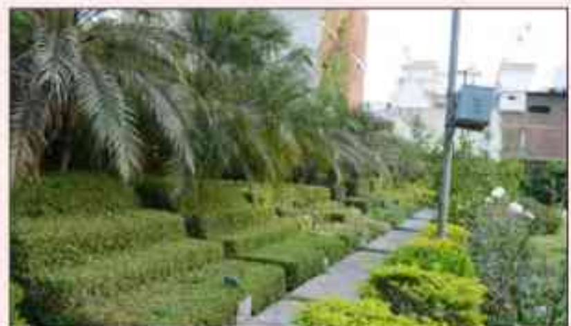
A view of the garden of Sai Dham