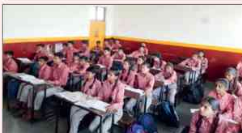
Class Room of Shirdi Sai Baba School, Niswara