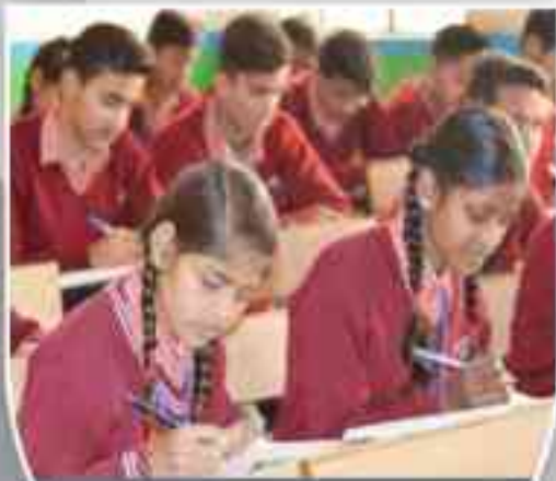
Free & Quality Education