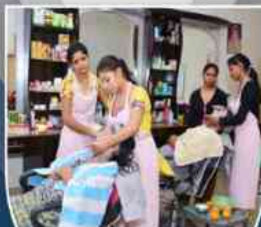
Beauty & Wellness Training