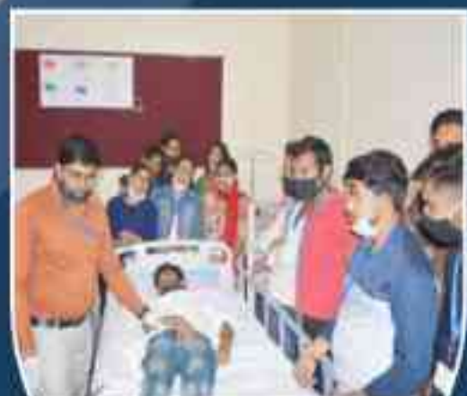
GDA Training (Patient Health Care)