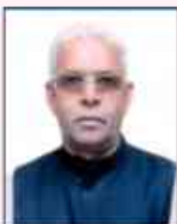
Mr. K. A. Pillay Community Services