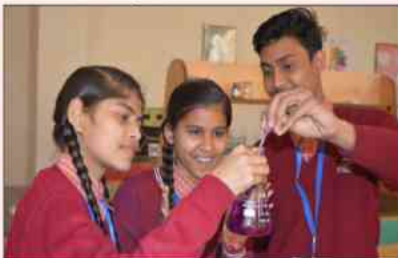
Children in Chemistry Lab