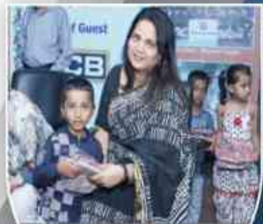
Free Distribution School Uniforms