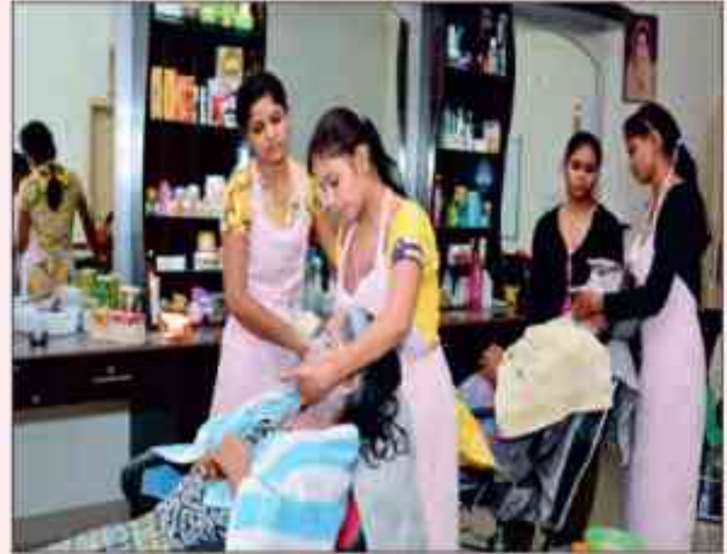
Beauty & Wellness Class, Vocational Training Centre