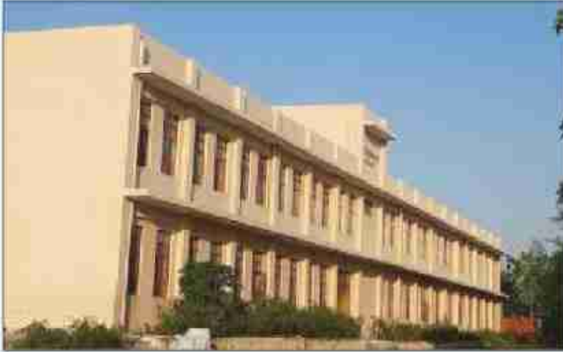
Shirdi Sai Baba School, Niswara, Dist. Mahoba (UP)

Education is essence of progress and it needs innumerable temples of learning. Our organization is committed to promote free and quality education all over the country to ensure that no child remains illiterate. In pursuance of this mission, we have set up a branch of Shirdi Sai Baba School in Bundelkhand's backward Village Niswara, Block Panwari, District Mohaba (UP).