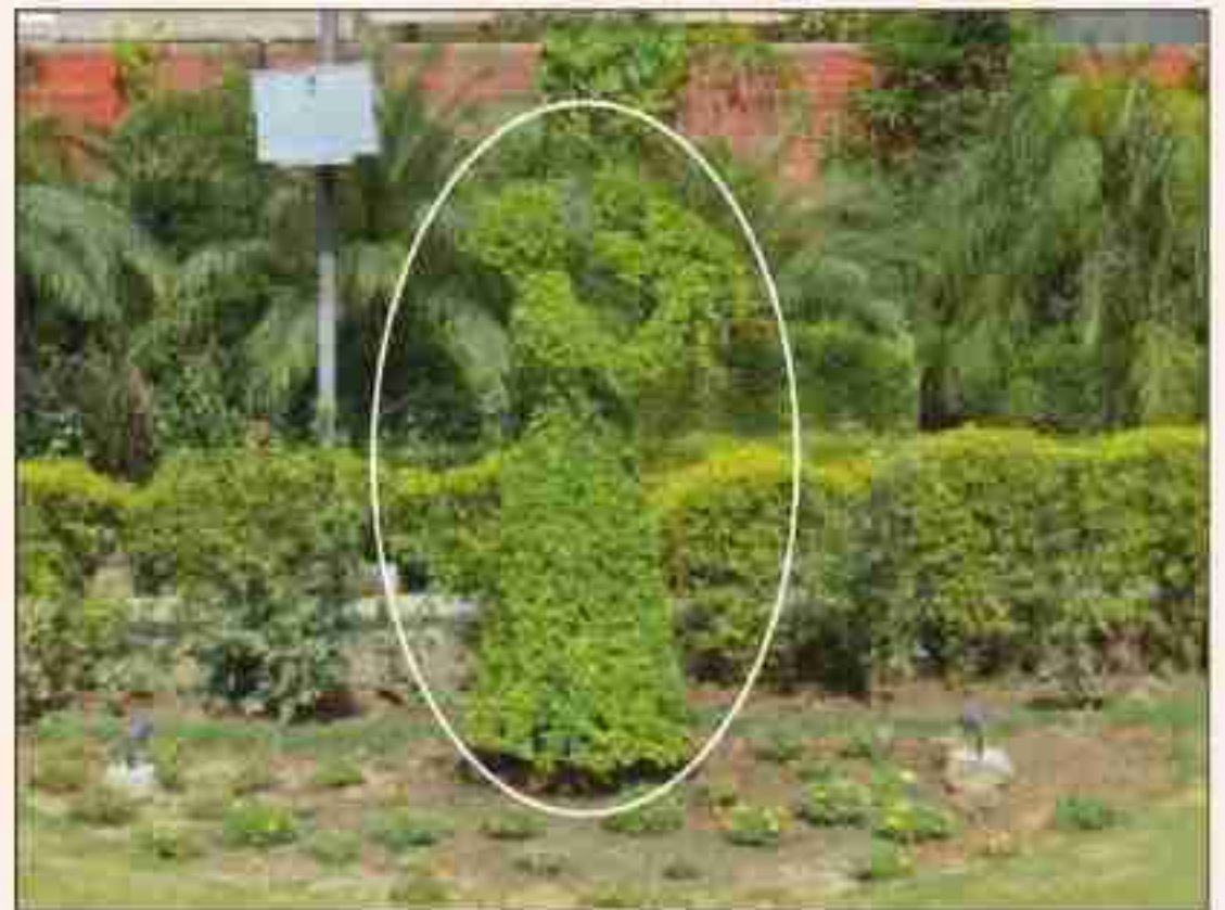
Mother's love displayed in greenery