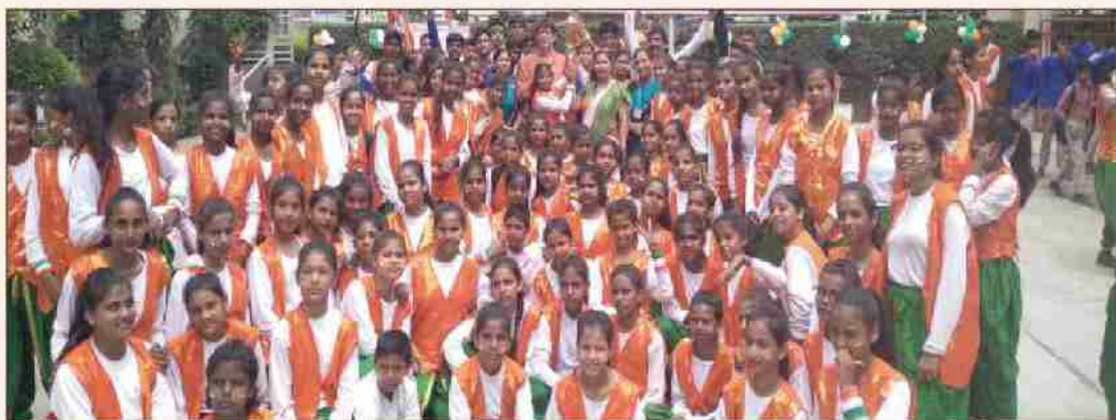
School won 2nd prize at Independence Celebrations of Faridabad Administration