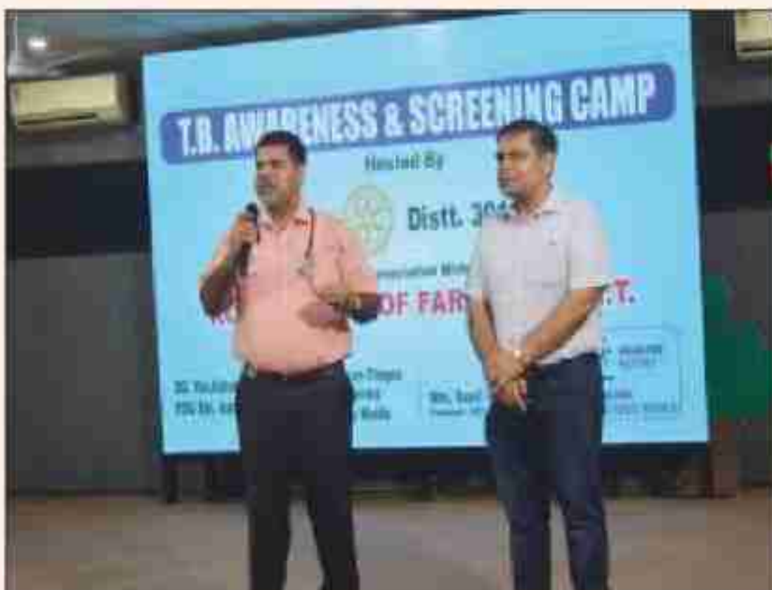
TB Awareness Camp