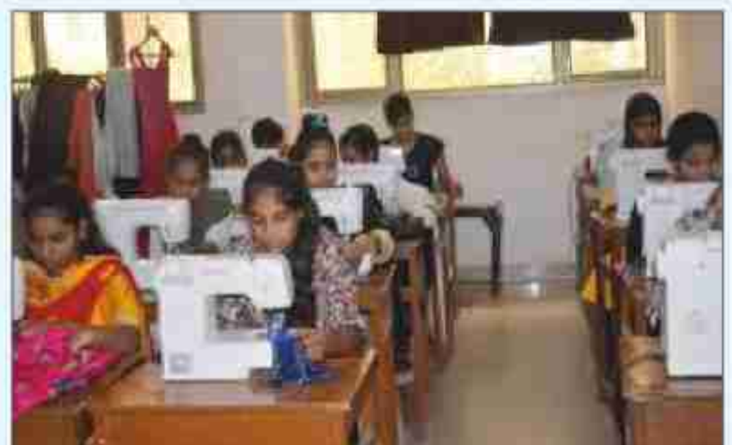
Fashion Design Tailoring Class