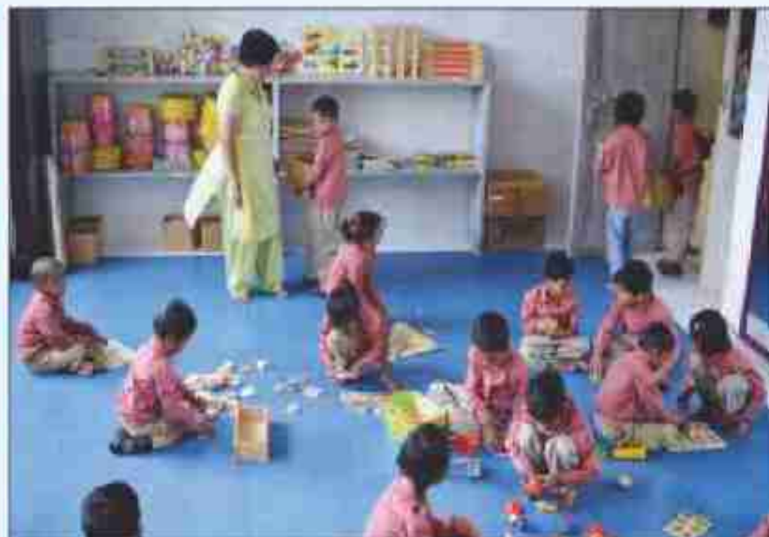
Pre-School: KG Class Activity Room