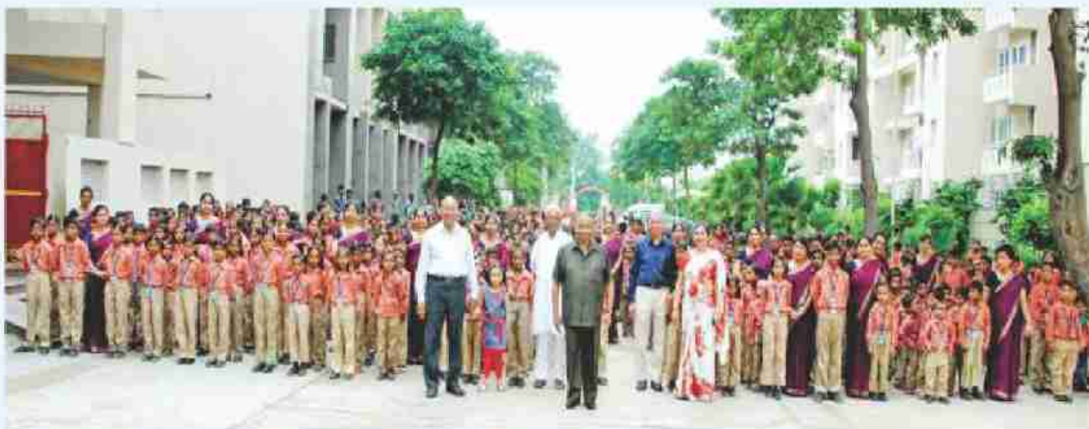
Independence Day Celebrations at Shirdi Sai Baba School, Faridabad

Shirdi Sai Baba Temple Society is a registered non-for-profit, free educational Institute and it aims to have a positive impact on the society. It works towards implementing holistic social development projects related to Education, Women Empowerment, Skill Development, Healthcare, Health & Hygiene (Preventive Health care), and Livelihood.