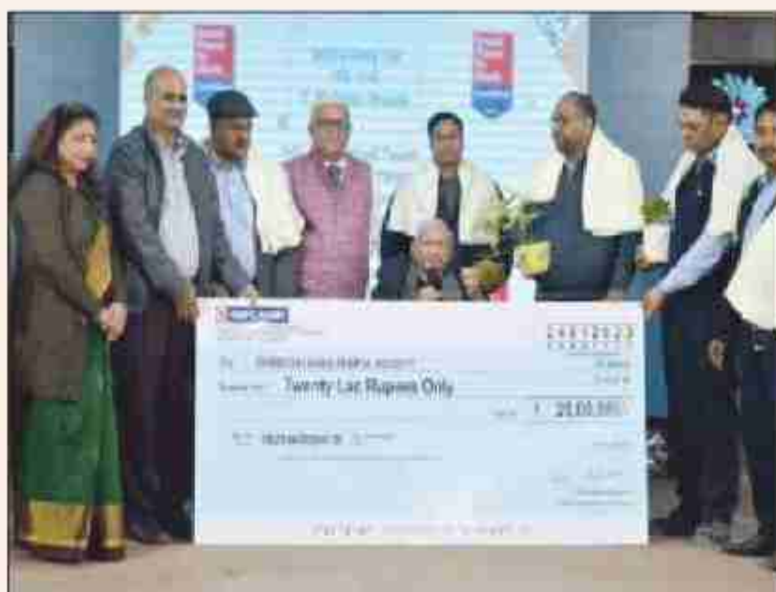
HIL Donated Rs. 40 Lakh in year 2021-22 & Rs. 20 Lakh in year 2022-23 for Education of less fortunate kids