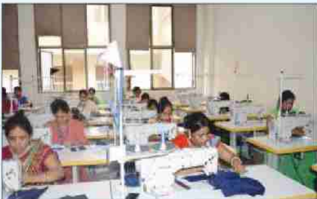
Industrial Tailoring Class, Vocational Training Centre

To provide an opportunity to youth hailing from under-privileged segment of the society, the institution is imparting free vocational training in the fields of 'Industrial Sewing Machines, Domestic Tailoring, Dress Designing, Beauty & Wellness, Computer Education and General Duty Assistant (Patient Health Care). After completion of the training our Institution assists them in placements.