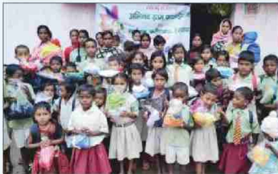
Distribution of Clothes

In India, 60-70% tribal and poor people do not have adequate clothes to cover their bodies. The situation is worse during winter season. We collect unsoiled old clothes, toys, shoes, and utensils etc., recycle them and send two truck-loads per month to our associates in Bihar, Jharkhand, Chhattisgarh, Madhya Pradesh, Uttar Pradesh and Maharashtra for free distribution to tribal and poor people.