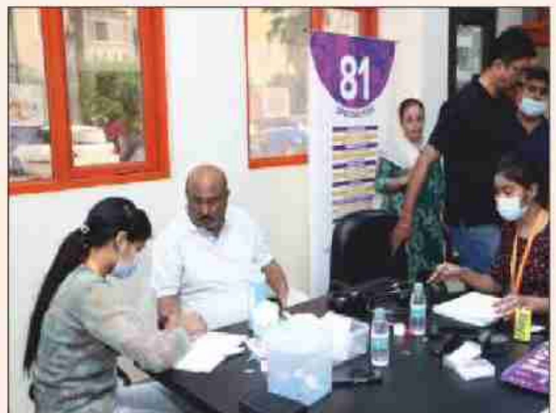
Health Checkup Camp