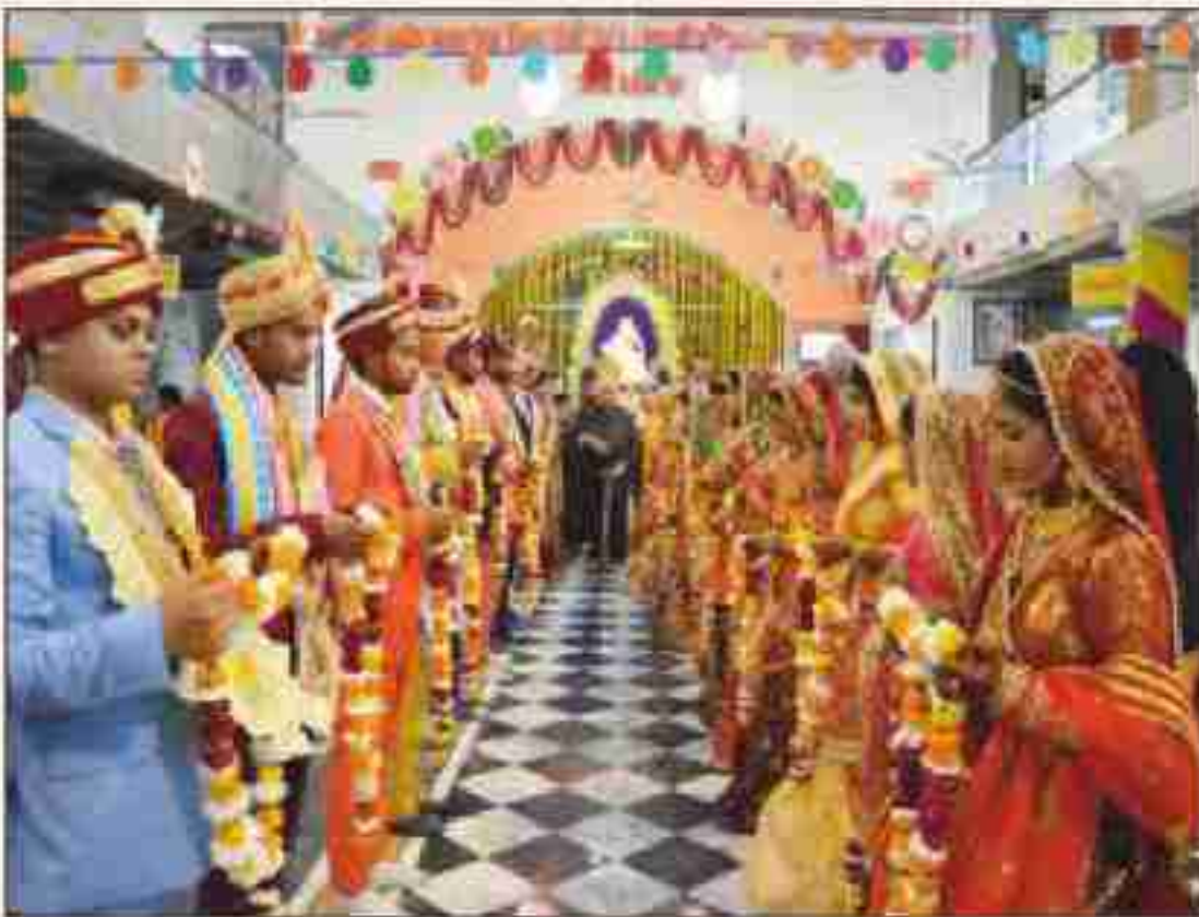
Mass Marriage Jai Mala