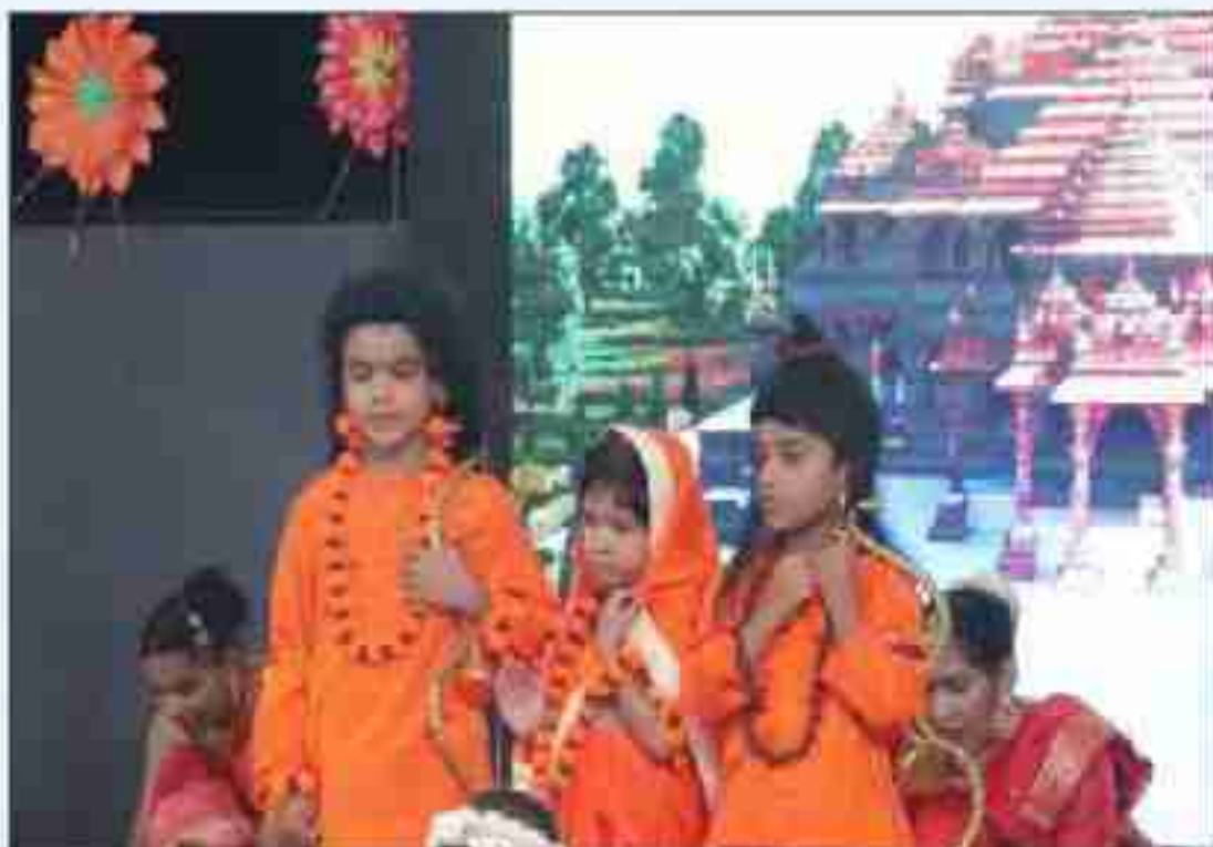
Play by KG class students

It is a well-known reality that a child's brain maximum develops between 3 to 6 years. Underprivileged rural children of the society need special attention at this age. Keeping this in view we have set up Pre-School-KG classes on the basis of performing arts under guidance of Buildingkidz Inc. USA. It has resulted in better performance, an increase in their desire to learn and there has been a distinct improvement in their IQs.