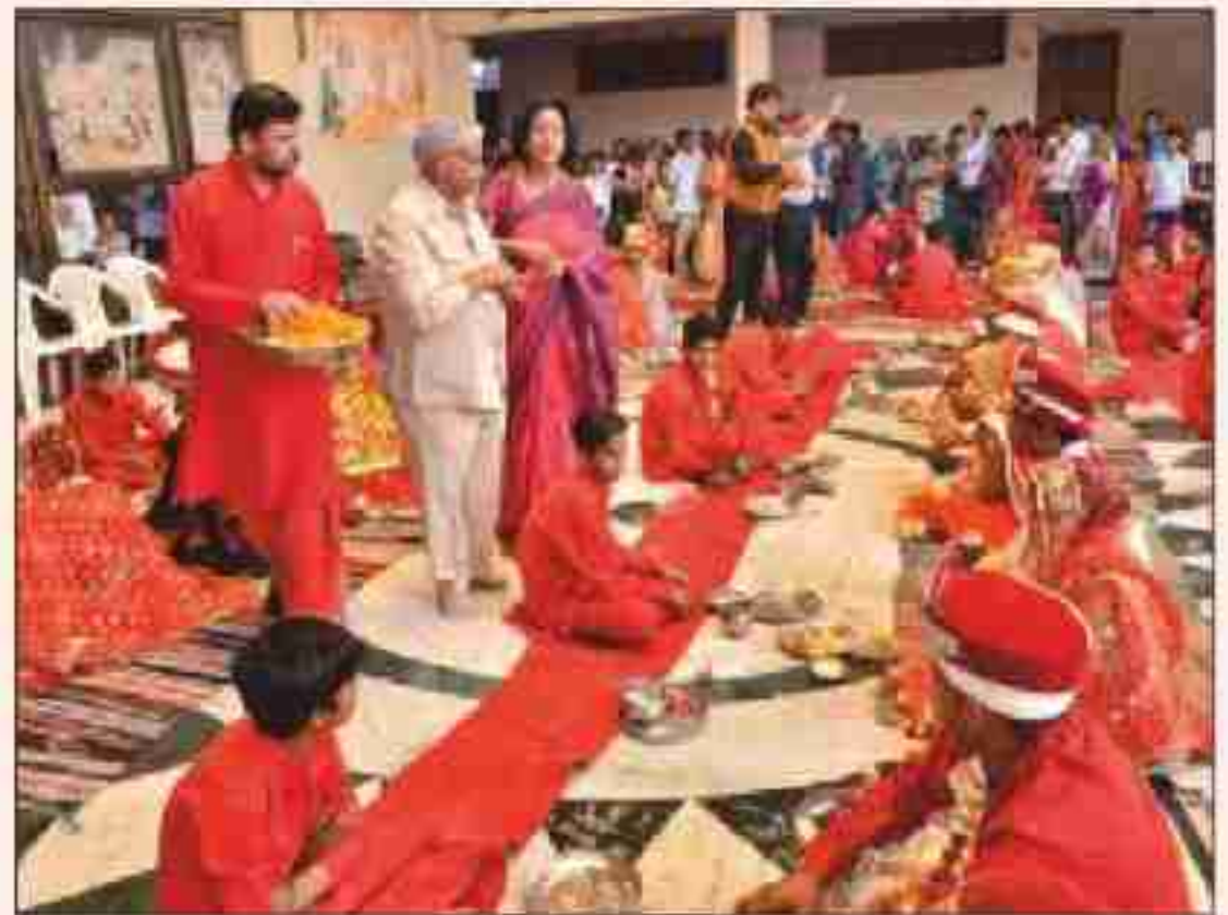
Mass Marriage Phere