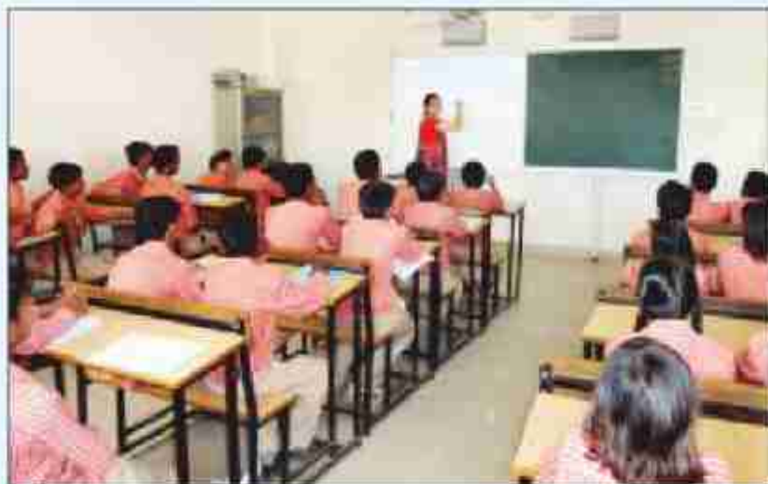
One of the Smart Classes