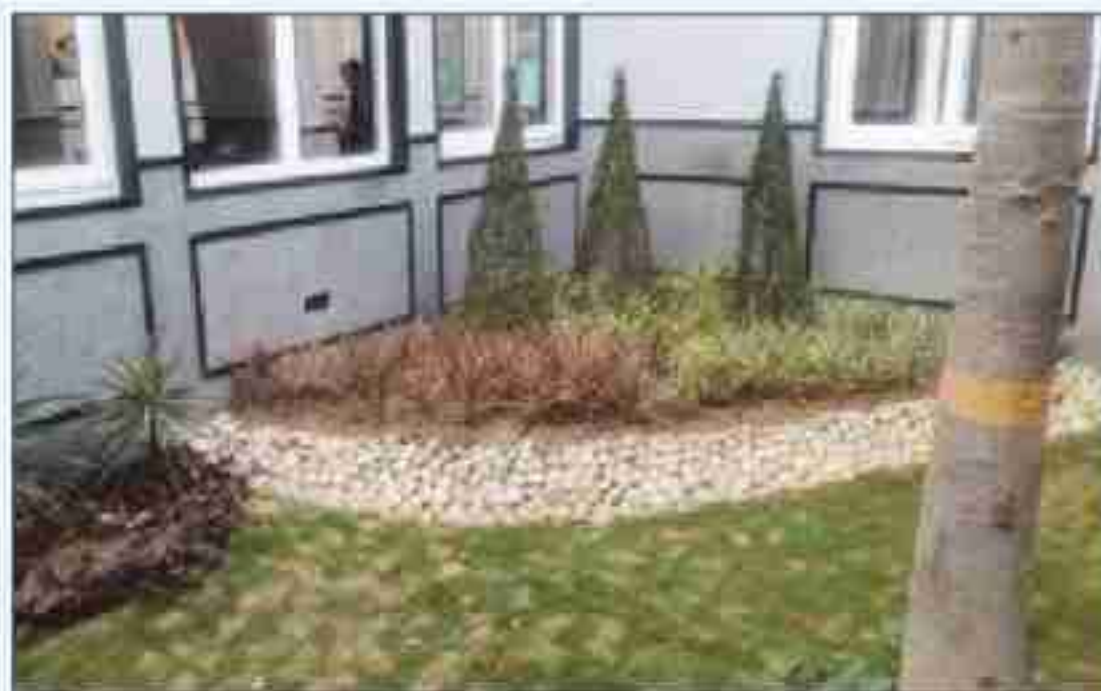
Sai Dham Park view

Beautiful garden is developed in Sai Dham and two public parks in sector 15 Faridabad are maintained by the Organization. Trees take carbon dioxide from the atmosphere for their own growth and produce oxygen which we breathe. Shirdi Sai Baba Temple Society (Sai Dham) has planted and is maintaining 69 suitably distanced Neem Trees at Sai Dham Marg, Sector 86, Faridabad on the verge of the road with tree guards. Sai Dham's initiative for mother nature will be advantageous to generations to come as it will give shade, clean & cool air, and place for birds to make nests. The neem tree is of great importance for its disinfectant properties. It is used for maintaining soil fertility and its extract is added to fertilizers as a nitrification inhibitor. Neem has traditionally been used as a teeth cleaning twig. It is also useful for cure of many diseases.