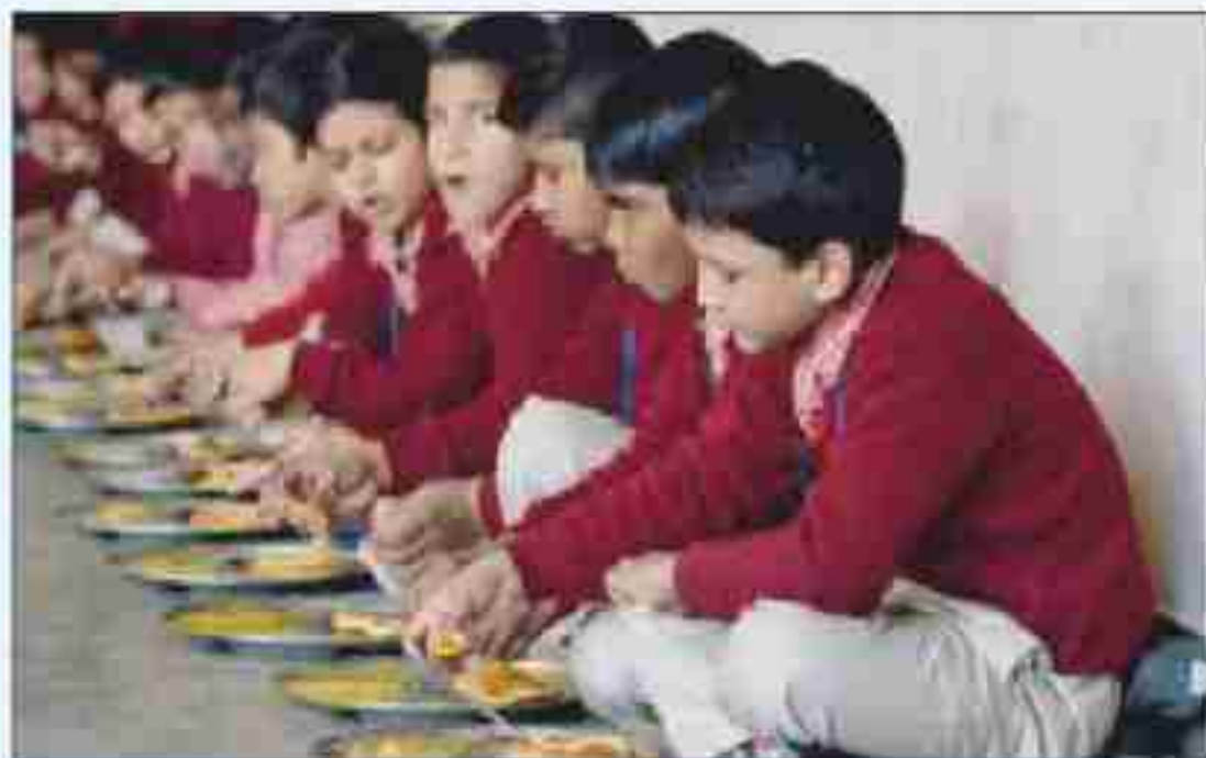
Children enjoying nutritious food