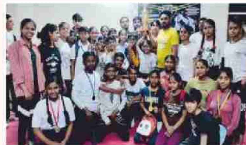
Students won 1st Prize in HS Tiger Karate Championship 2022