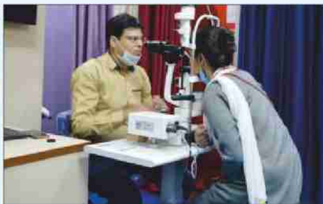
Eye Clinic at Sai Dham