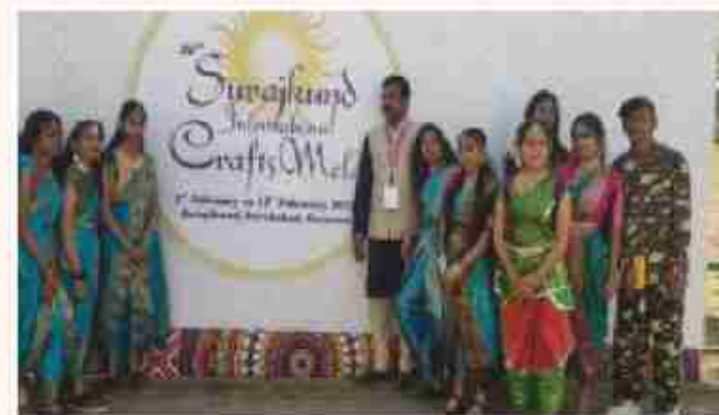
Students' Group photo who participated in dance rituals