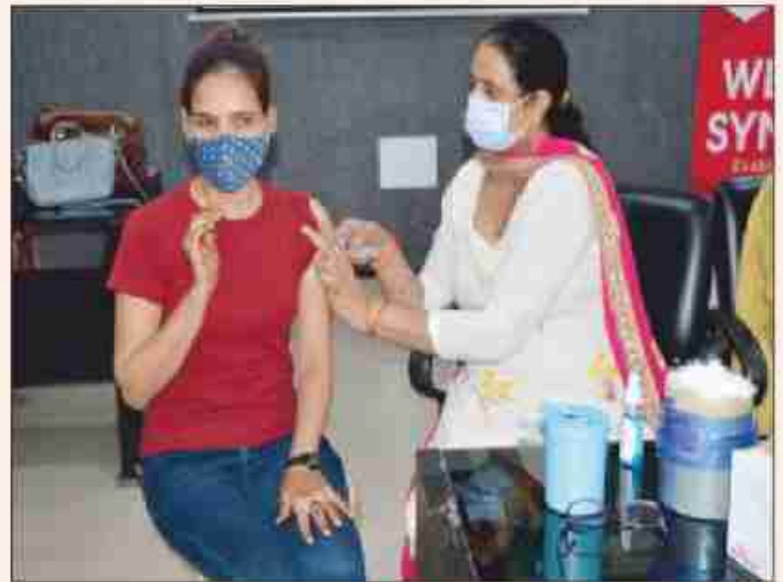
Covid Vaccination Camp