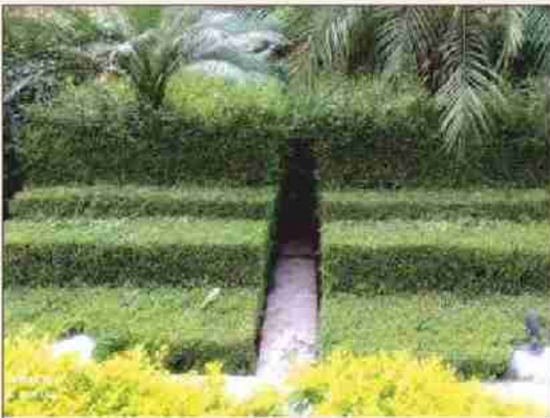
A view of garden at Sai Dham