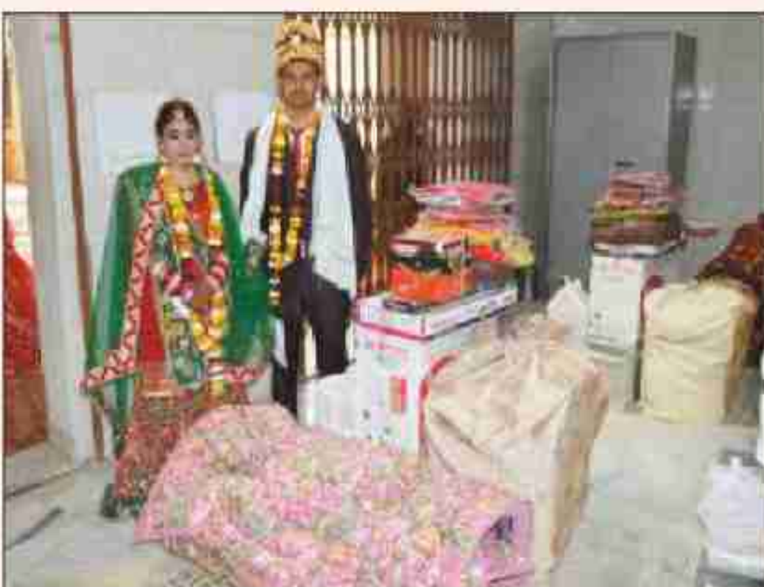
Items gifted to each couple