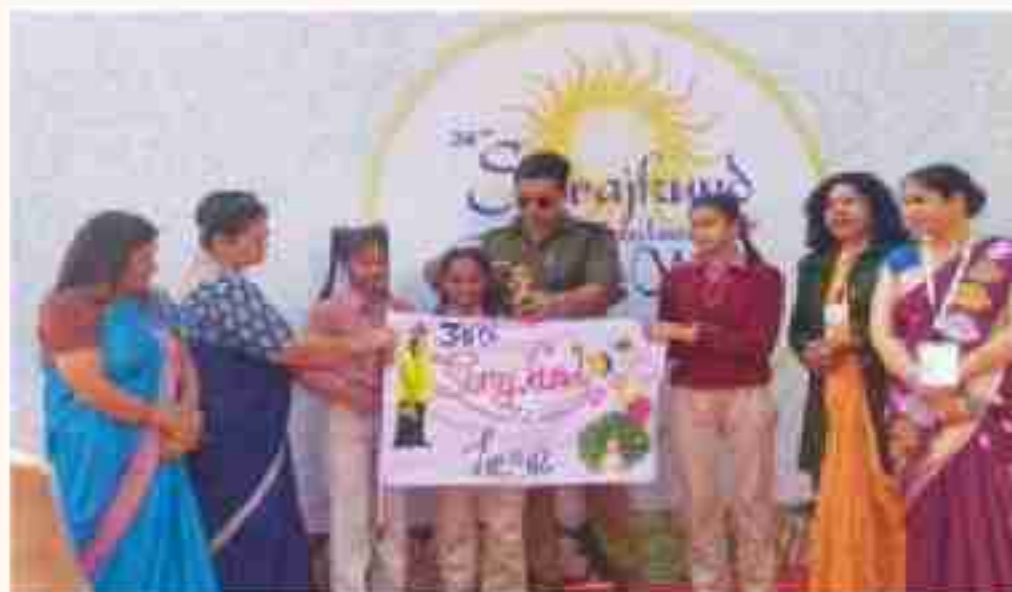
Students won 2nd Prize in Flag Making Competition in Senior Category 14-18 years