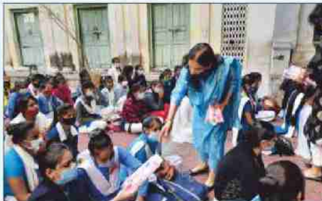
Sanitary Napkin Distribution