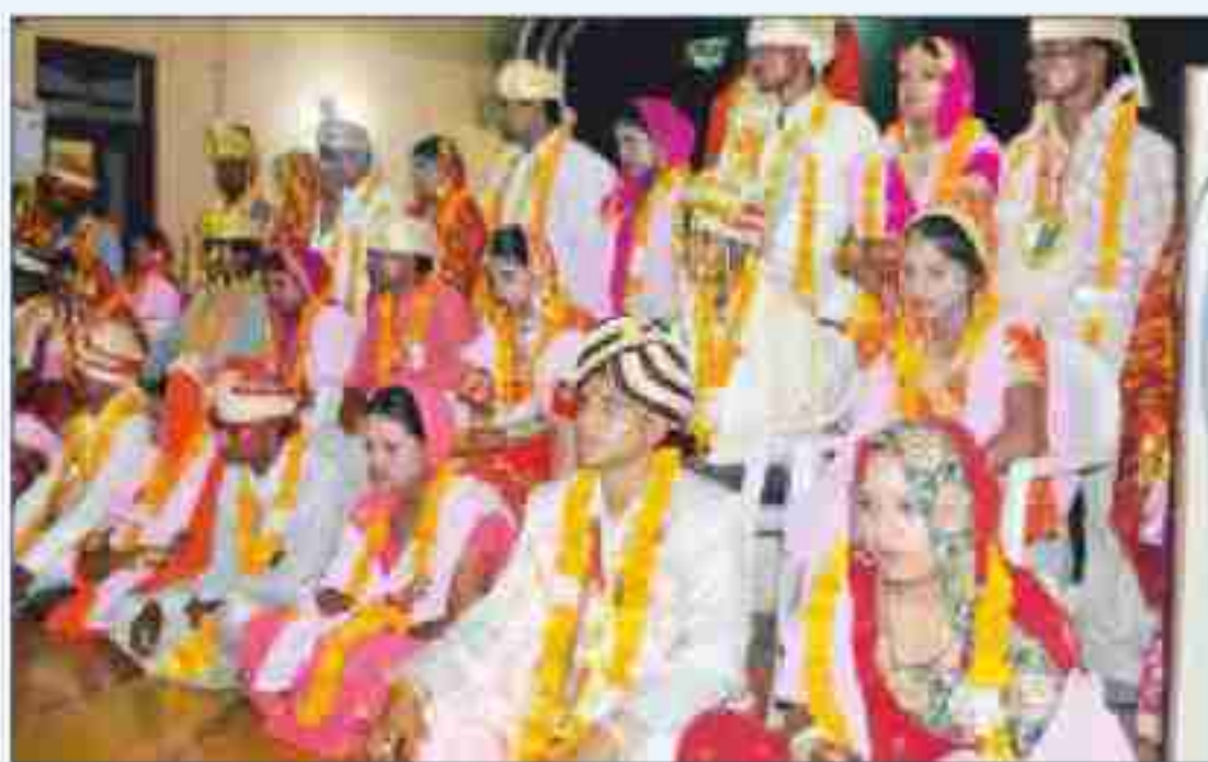
Mass Marriage Event

To mitigate hardships of poor parents, Mass Marriages of about 100 girls are performed four times in a year, irrespective of caste, creed and without any expenditure whatsoever to the parents. So far more than 1200 marriages have been performed. This is being done primarily to solve financial difficulties that the underprivileged people face in arranging funds for marriage of their daughters. They, often, are forced to borrow thousands of Rupees on interest even @ 5% per month and which they are unable to repay back throughout their lives.