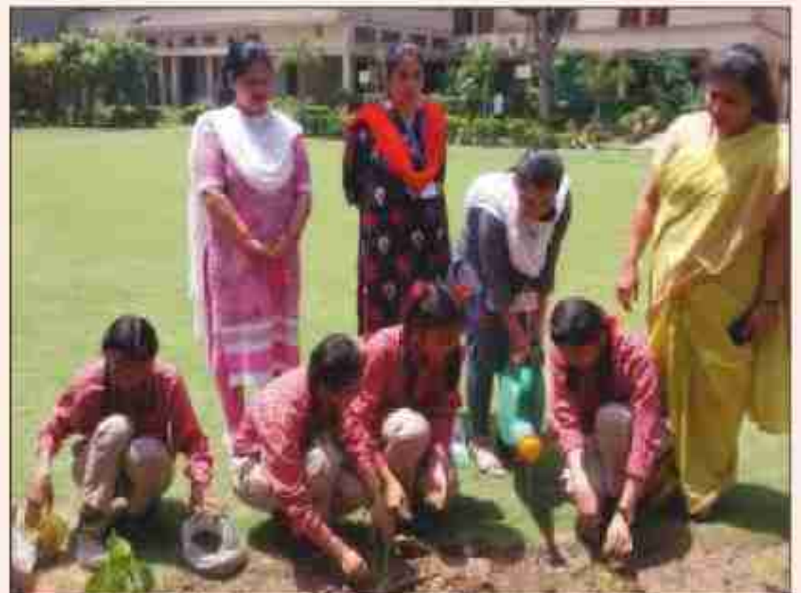
Fresh Plantation by Students