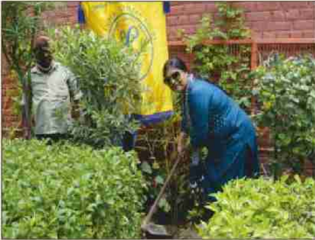
A view of garden at Sai Dham