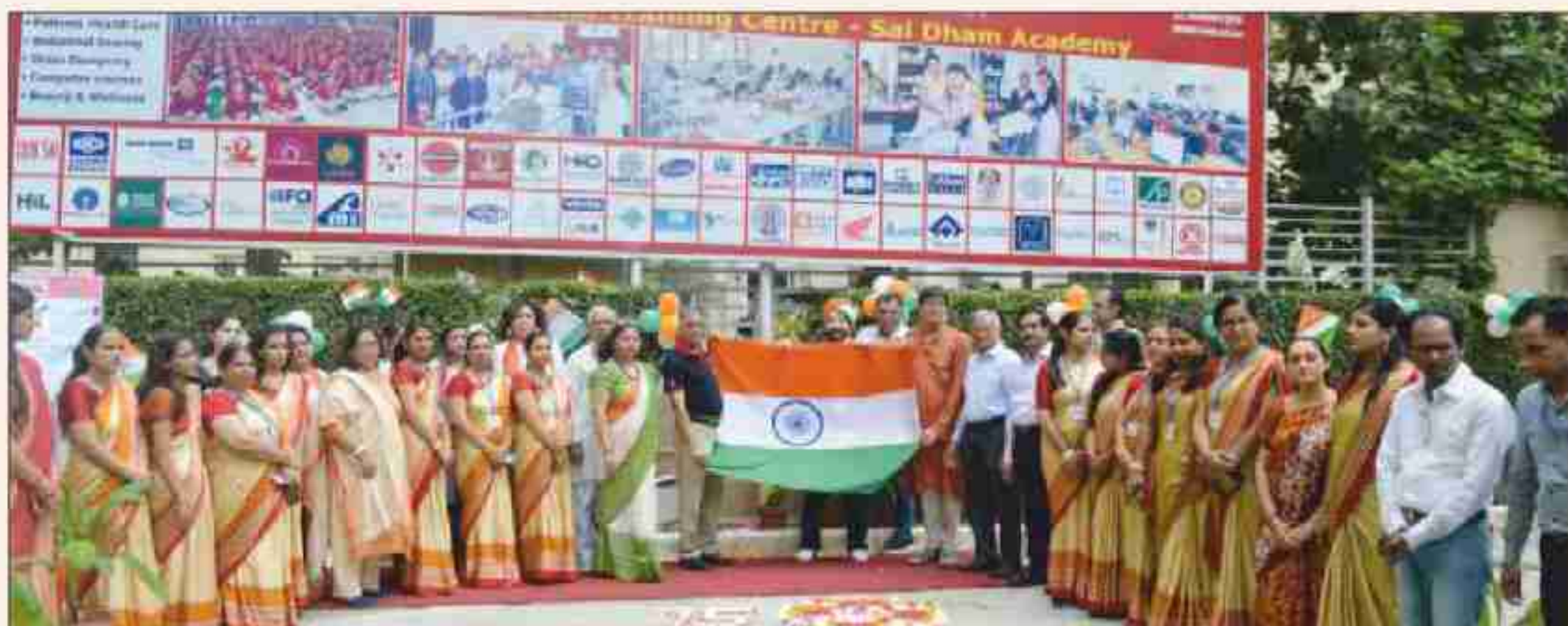
Independence Day 2022 Celebrations