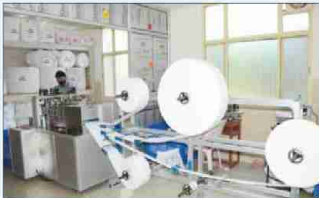
Sanitary Napkin Manufacturing

The unhygienic period health and disposal practices can have major consequences on the health of women. This increases the chances of reproductive tract infections, urinary tract infection, hepatitis B infection and various types of yeast infections, and even cervical cancer, to name a few, in women. For safeguarding their health, we manufacture and distribute Sanitary Napkins free to rural girls and women.