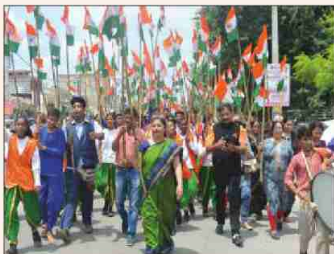
Independence Day Tiranga Rally