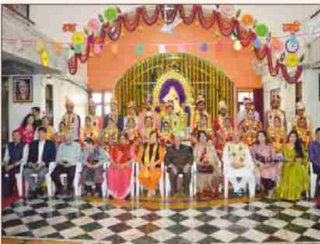
Group photo of couples