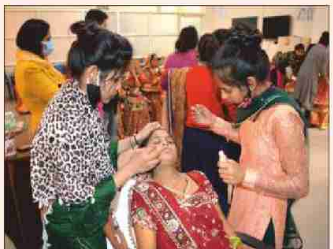
Make-up of the Brides