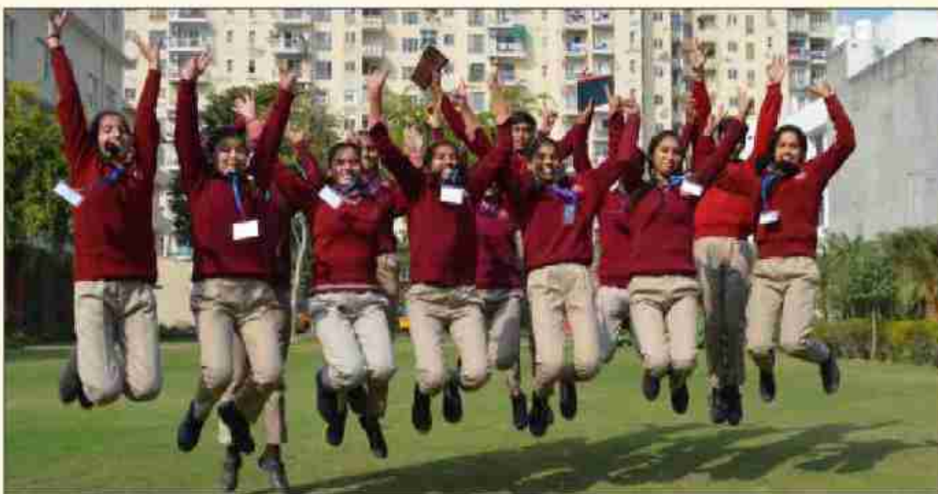
(Happiness of students receiving free education with amenities)

I wish more philanthropists could take up similar cause of providing free and quality education to the less fortunate children and make India shine by uplifting the underprivileged.