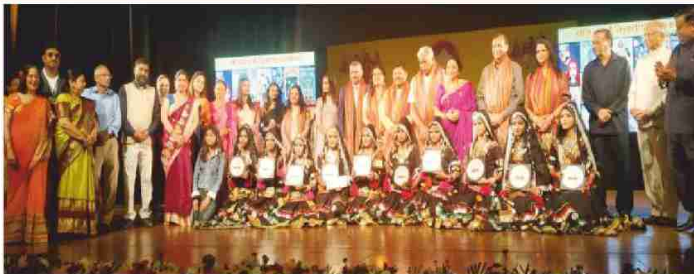
School won 1st Prize in the Dance Competition