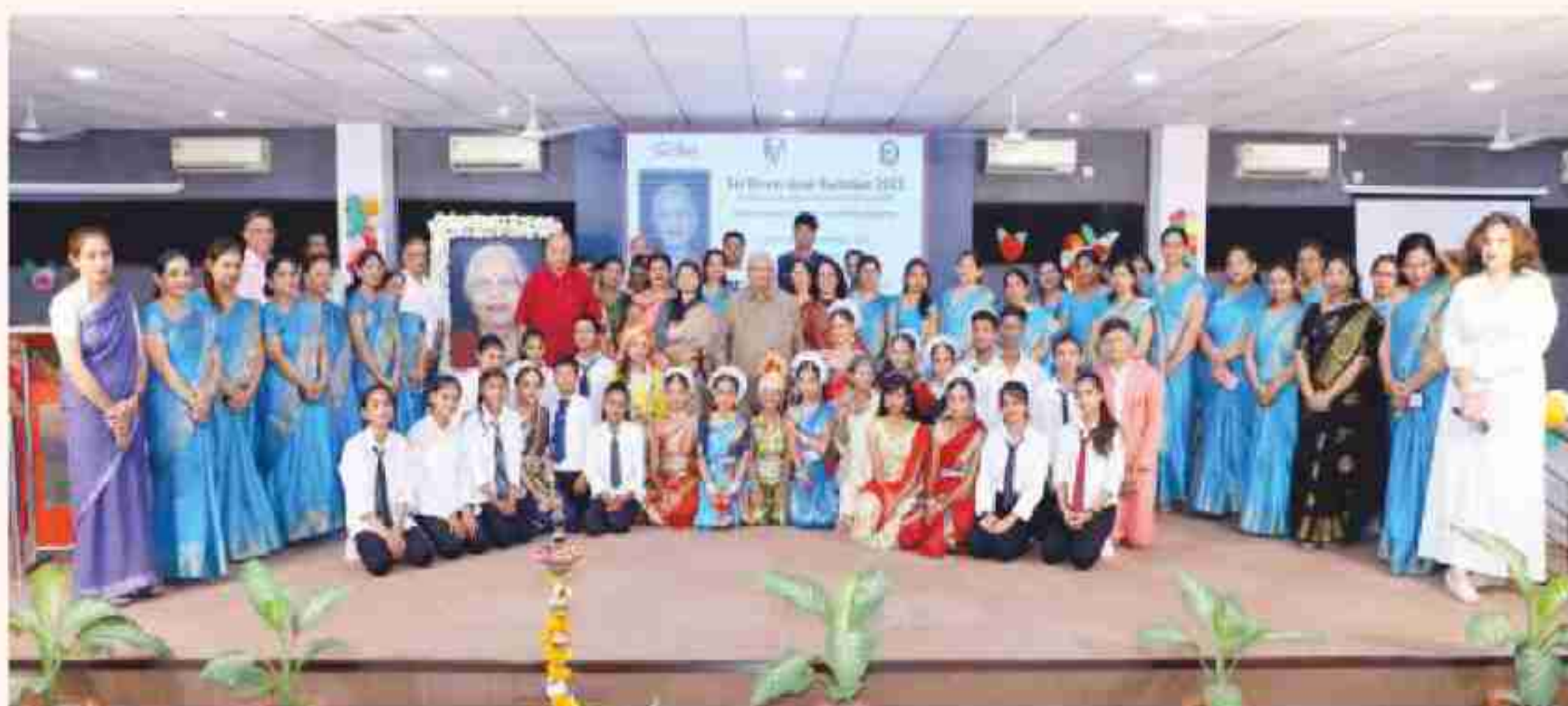
Chief Guest, Dignitaries, Awardees, Teachers and Students who gave dance performances