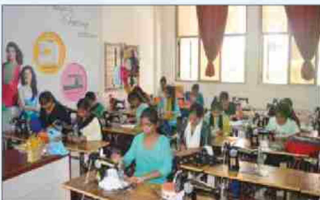
Domestic Tailoring Class