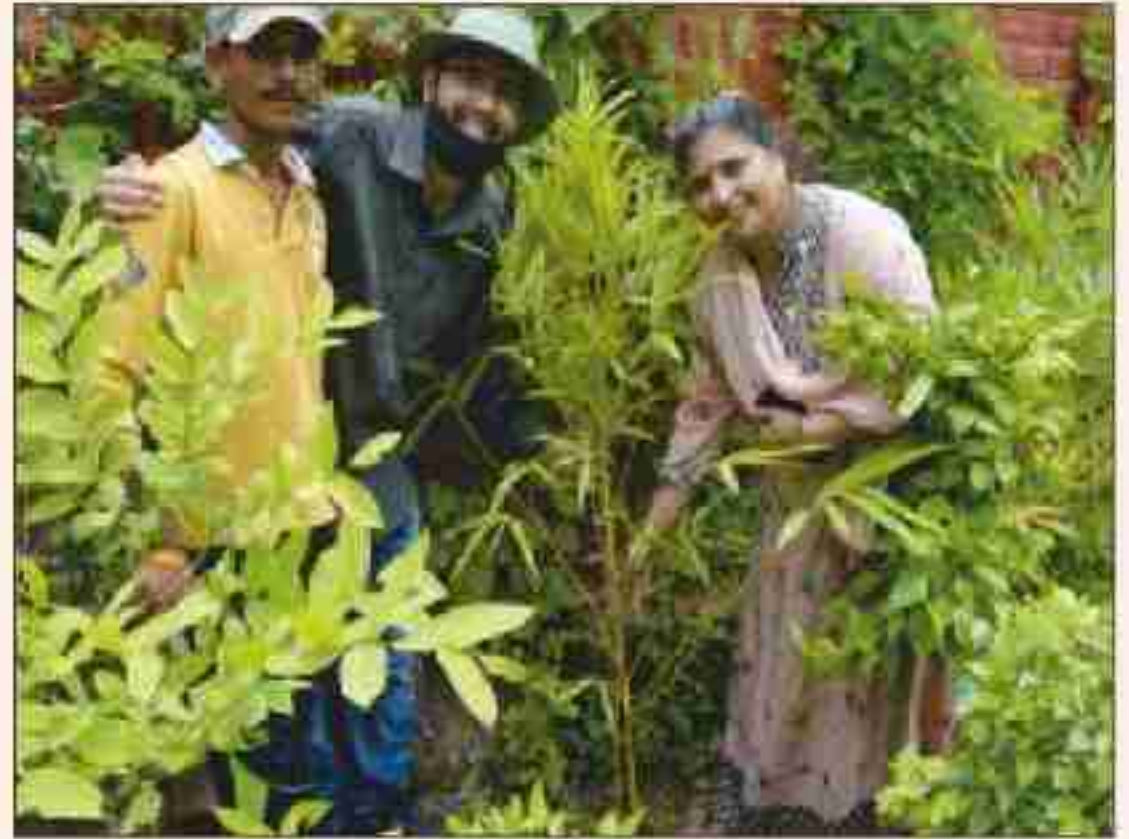
A view of garden at Sai Dham