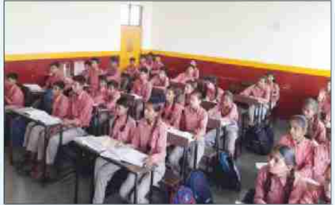
Class Room of Shirdi Sai Baba School, Niswara