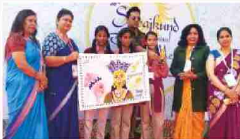
Students won 1st Prize in Flag Making Competition in Senior Category 14-18 years