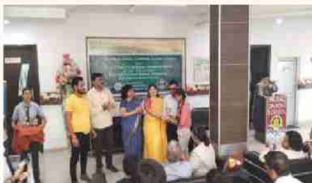
Student won 1st Prize in Inter School Carom Championship 2022