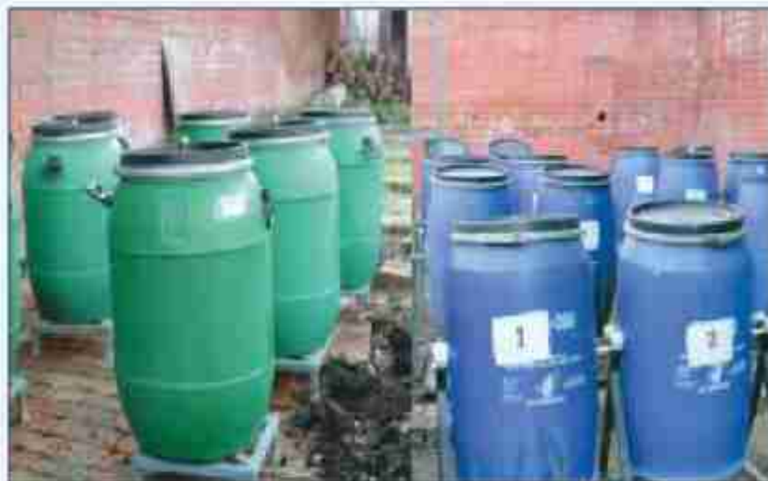
Making Organic Compose and Bio Enzyme