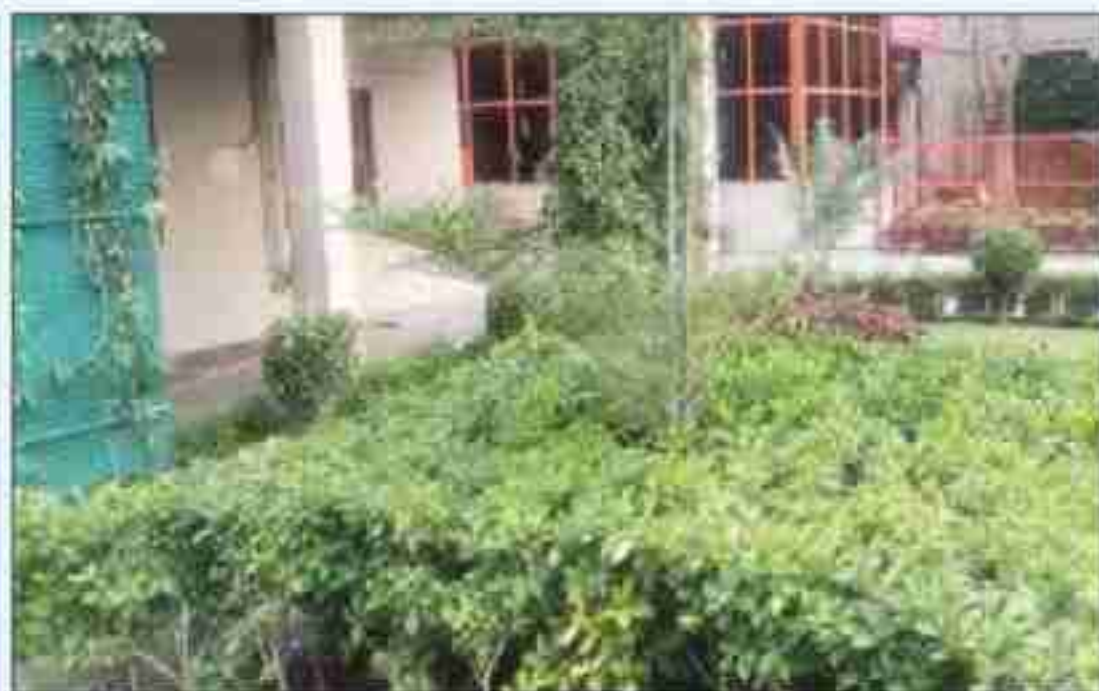
Sai Dham Park view