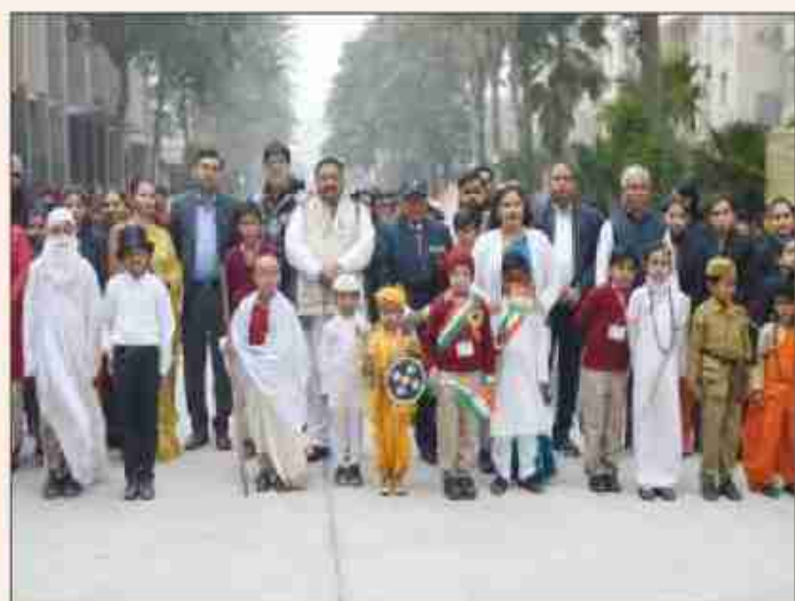
Republic Day 2023 Celebrations