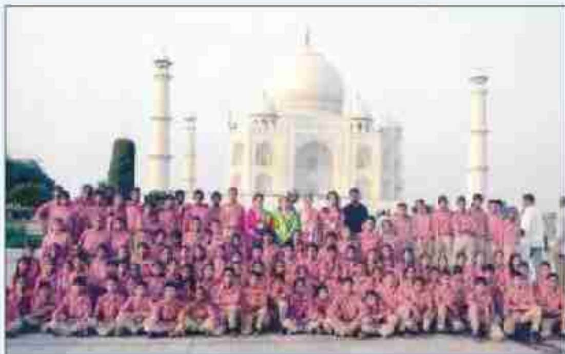
Excursion to Taj Mahal, Agra

A well-furnished Library, excellent chemistry, physics, biology and maths labs, meditation, cultural activities, indoor, and outdoor sports facilities are also provided to the students.