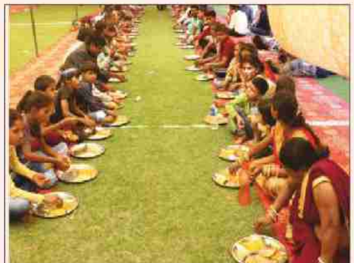
Marriage party taking food