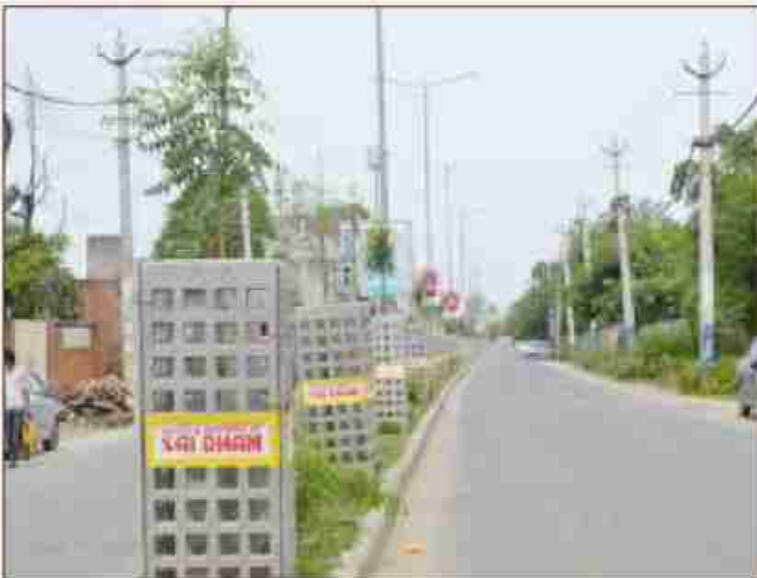
69 Neem trees planted on the verge of Sai Dham Marg