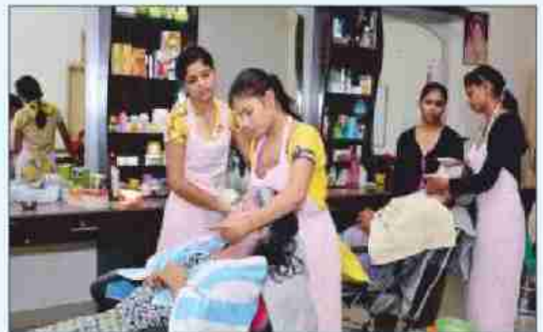
Beauty & Wellness Class, Vocational Training Centre